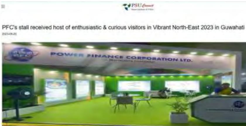
PFC's stall received host of enthusiastic & curious visitors in Vibrant North-East 2023 in Guwahati