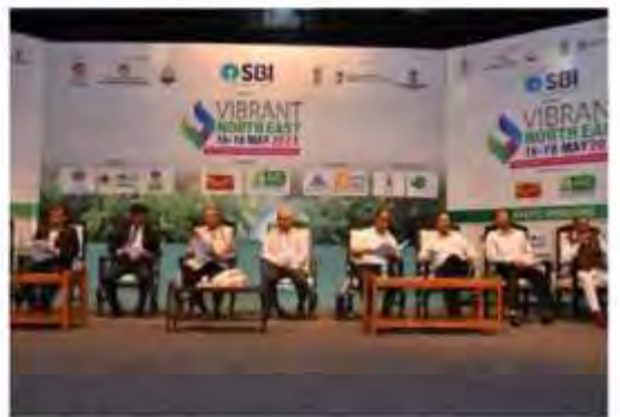
Seventh Vibrant North East Summit